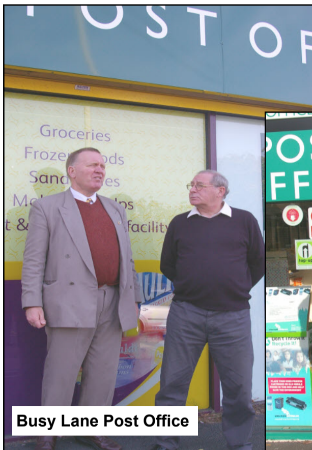
Busy Lane Post Office